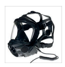
3rd Party BA Supports 3rd party BA comms kits