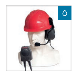
CHP950HS/DT9* Single sided ear defender headset for hard hat use