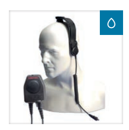
CXR5/DT9 Bone conductive skull mic with in-line PTT