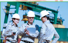
Port & Airport

PH600/PH660 is a cost-effective DMR radio with compact design, friendly UI, large battery, excellent sound quality, making it deployable in all commercial industries.